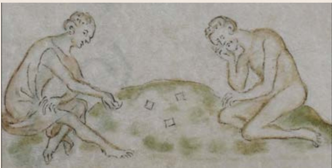
Queen Mary Psalter f.167v